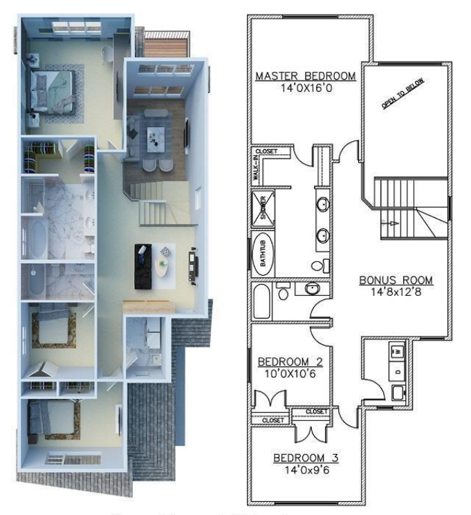
Upper Floor - 1147 sq.ft.

DATA IS DEEMED RELIABLE BUT IS NOT GUARANTEED ACCURATE BY THE REALTORS® ASSOCIATION OF EDMONTON. COPYRIGHT 2025 BY THE REALTORS® ASSOCIATION OF EDMONTON. ALL RIGHTS RESERVED. Trademarks are owned or controlled by the Canadian Real Estate Association (CREA) and identify real estate professionals who are members of CREA (REALTOR®, REALTORS®) and/or the quality of services they provide (MLS®, Multiple Listing Service®)