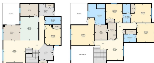
Main Floor Exterior Area 2348.01 sq ft

Main Building: Total Exterior Area Above Grade 2348.01 sq ft