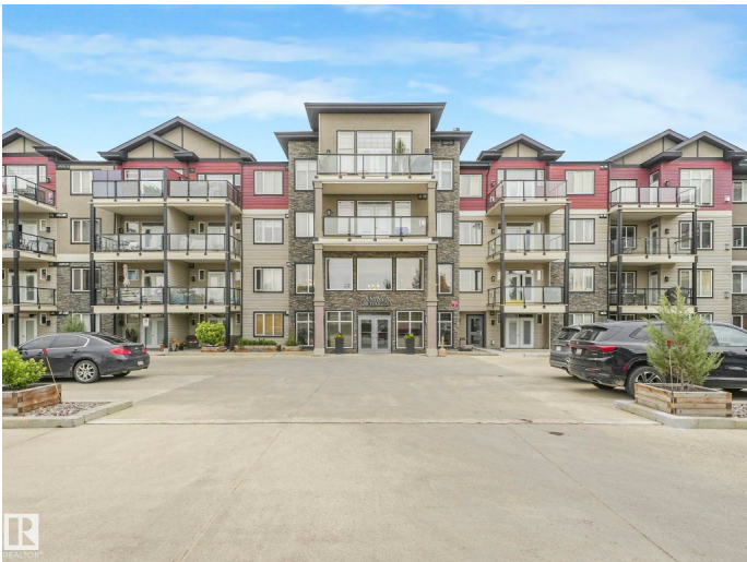
312-12408 15 Ave SW, Edmonton, AB